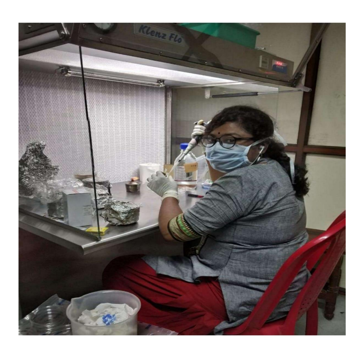
PhD student at Laminar air-flow work station

Recognised Under UGC 2F&12B WB Govt. Aided Affiliated to The University of Burdwan