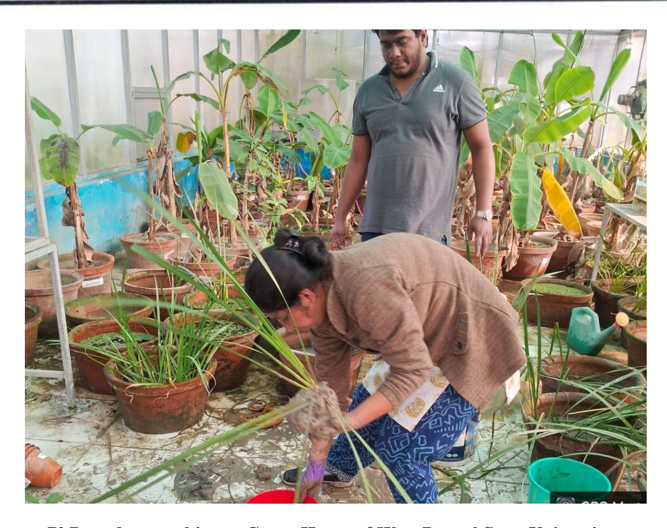
PhD student working at Green House of West Bengal State University

Recognised Under UGC 2F&12B WB Govt. Aided Affiliated to The University of Burdwan