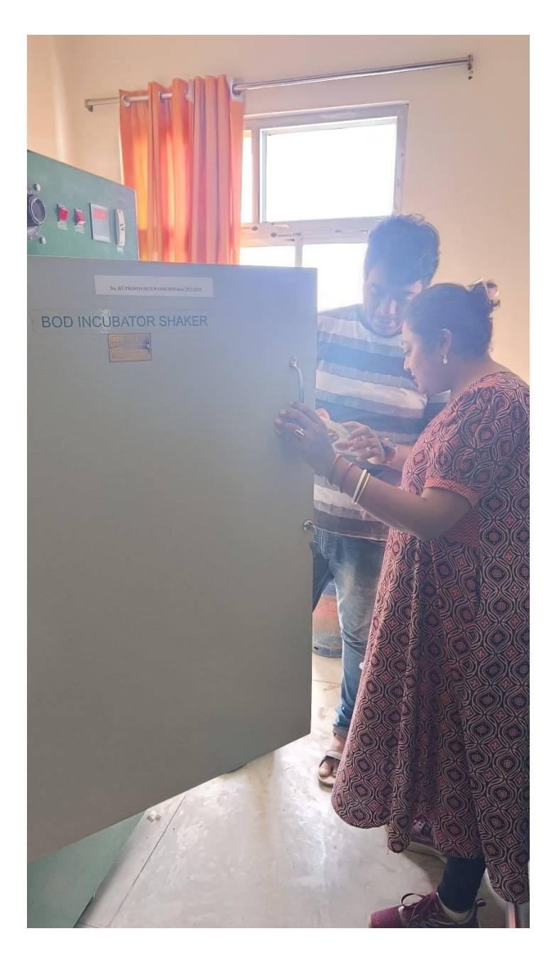
PhD students checking the bacterial growth plate after incubation at BOD Incubator Machine